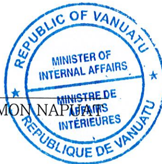
Honourable ANDREW SOLOMON NAPUAT Minister of Internal Affairs

MADE at Port Vila this 6 th day of September 2019.